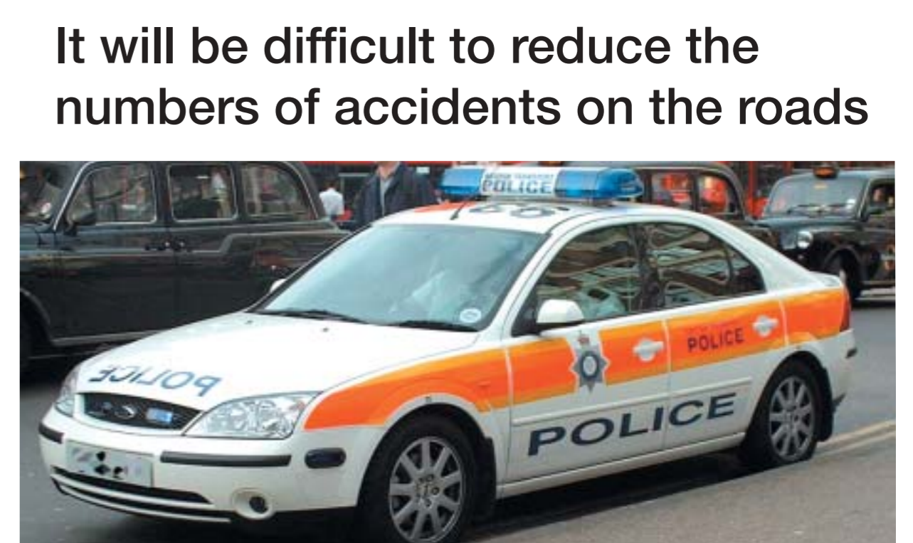
It will be difficult to reduce the numbers of accidents on the roads